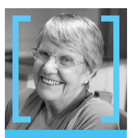
How have our plans been developed?