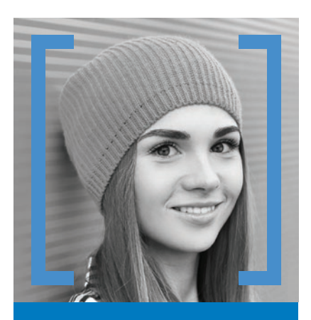
Why do we need a Sustainability and Transformation Plan?