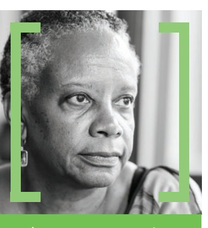
What are we going to do?