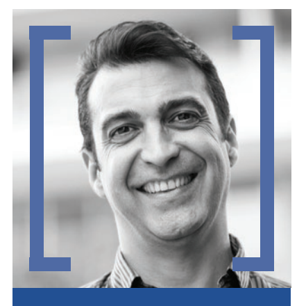
What is the Buckinghamshire, Oxfordshire and Berkshire West Sustainability and Transformation Plan?