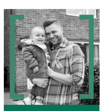
How can I get involved and find out more?